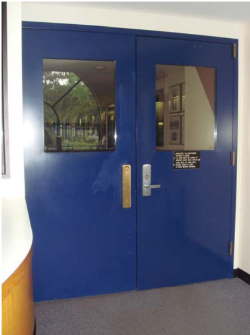
When Middlebury College replaced unsafe wired glass used in these doors, they chose C2C Silver Certified PYRAN Platinum F by SAFTI FIRST. (Project: Middlebury College in Middlebury, VT. Glazier: Desabrais Glass)