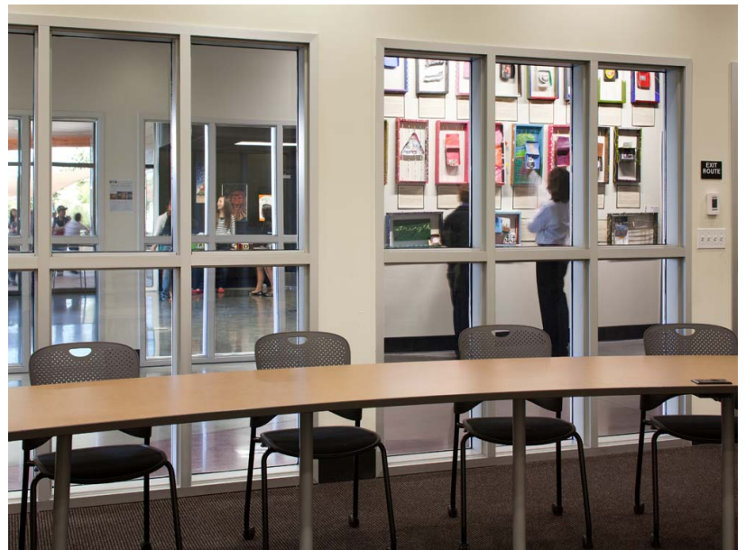
High Tech Middle School in Chula Vista, CA chose SuperLite II-XL 45 in HM Framing by SAFTI FIRST for the fire protective openings in this 1 hour corridor. SuperLite II-XL 45 also has an STC 40 rating, providing sound attenuation benefits in addition to clear views and fire protection. (Project: High Tech Middle School in Chula Vista, CA; Architect: Studio E Architects; Glazier: Vision Systems Inc.)