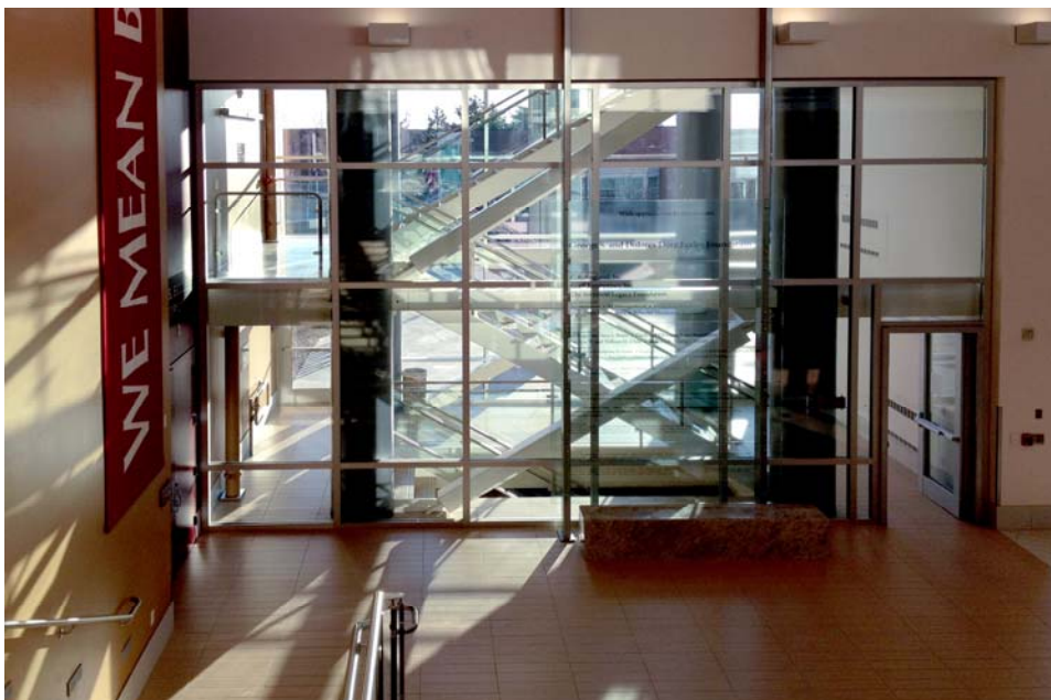
SuperLite II-XL in GPX Framing was used in this 2-hour stairwell to enable views to the outdoors and allow natural daylight to penetrate further in the building. (Project: David Eccles School of Business at the University of Utah. Architect: MHTN Architects. Glazier: Mollerup Glass)