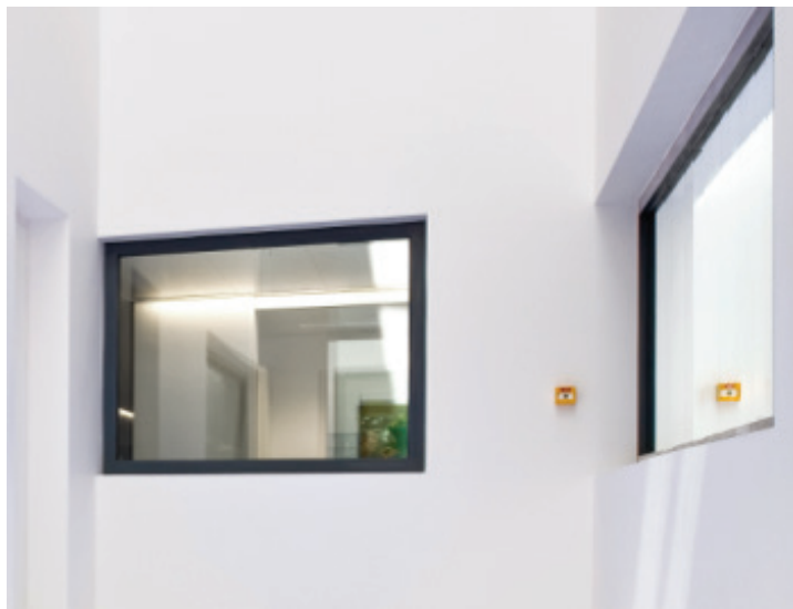
SuperLite II-XLM 45 in a 1-hour wall

20-45 Minute Fire Resistive Multilaminare Glazing