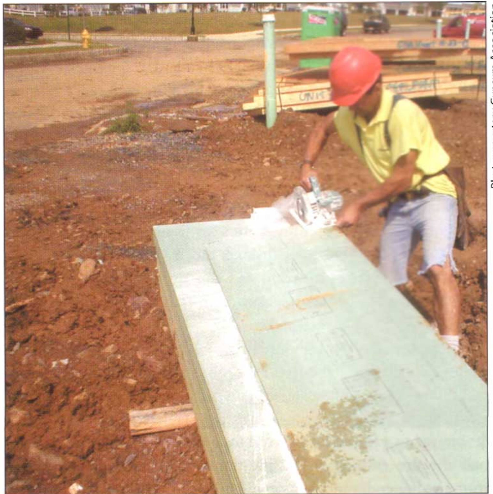
Liner panels are easily cut to facilitate installation.