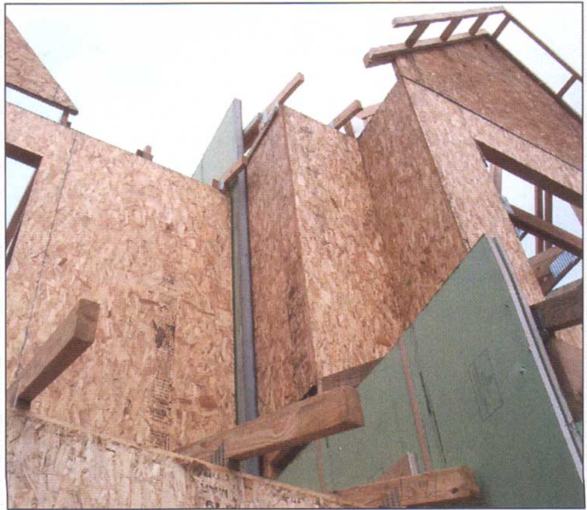
Townhouse units showing gypsum board area separation wall systems in place.

* Shoub, Harry, "Early History of Fire Endurance Testing in the United States," Symposium on Fire Test Methods (1961), ASTM Special Technical Publication No. 301, pg. 1.