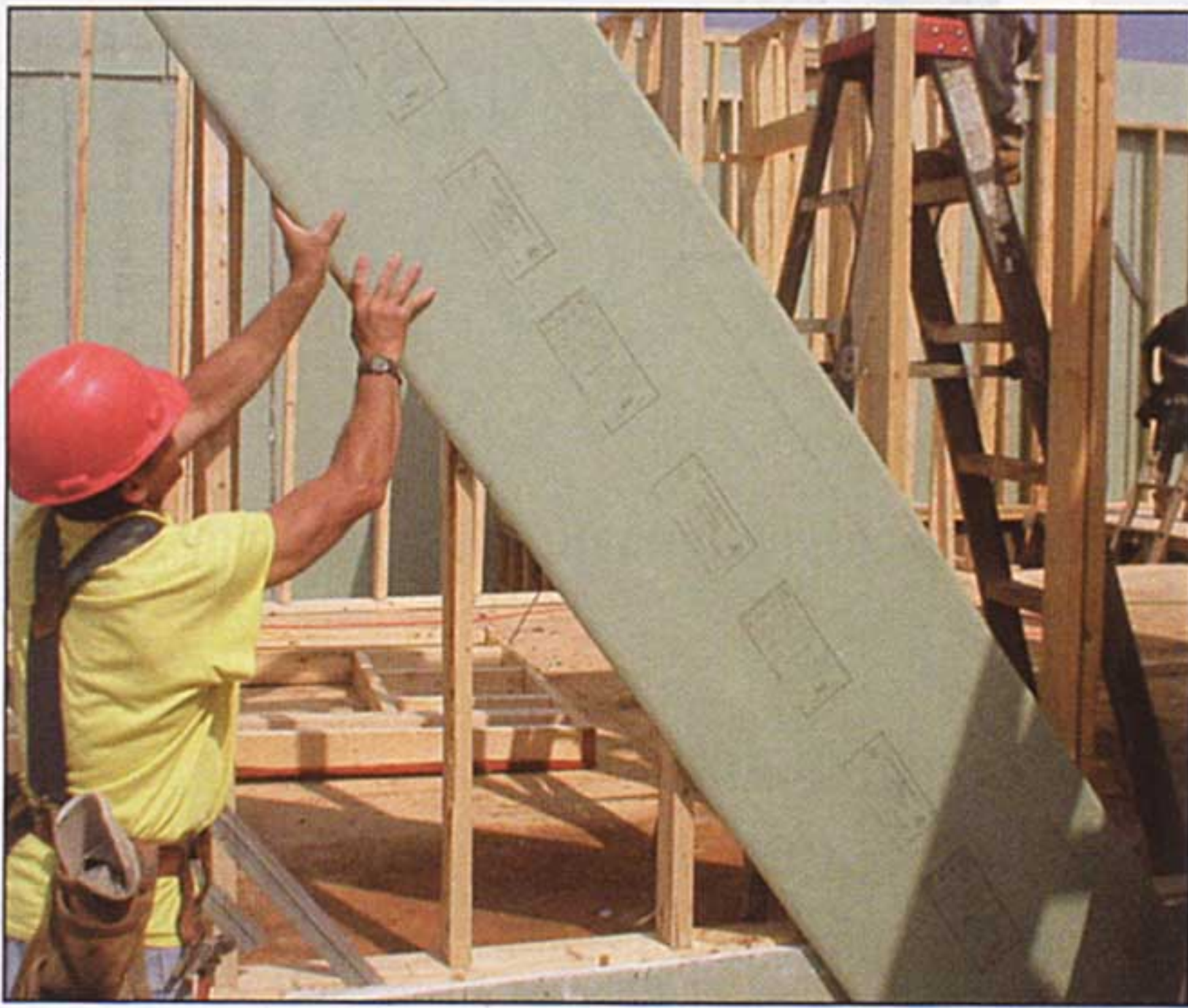
Erection of liner panels in a gypsum board area separation wall system.