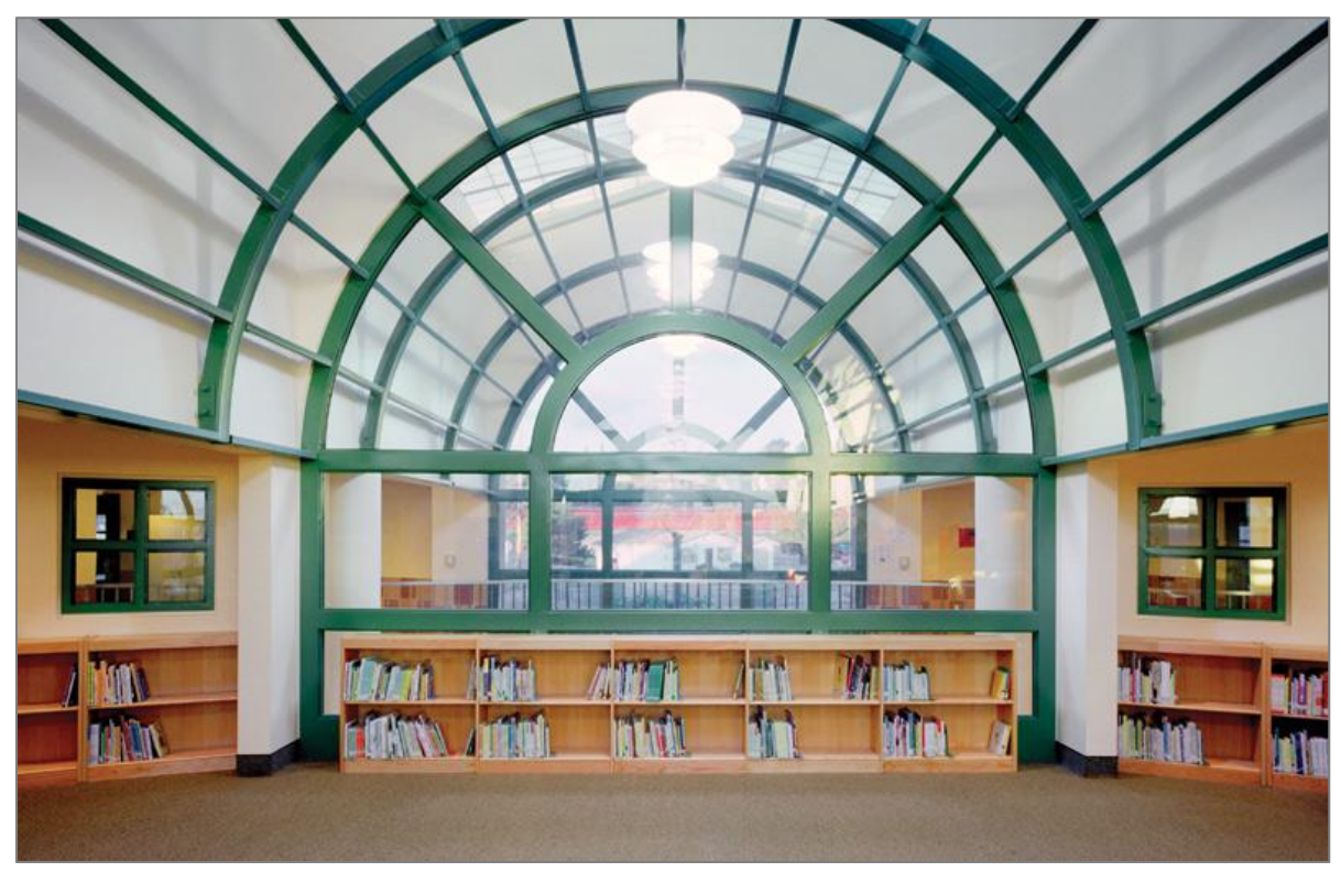
Fire rated glazing in the library at Sunset Elementary in San Ysidro CA pulls in day light.