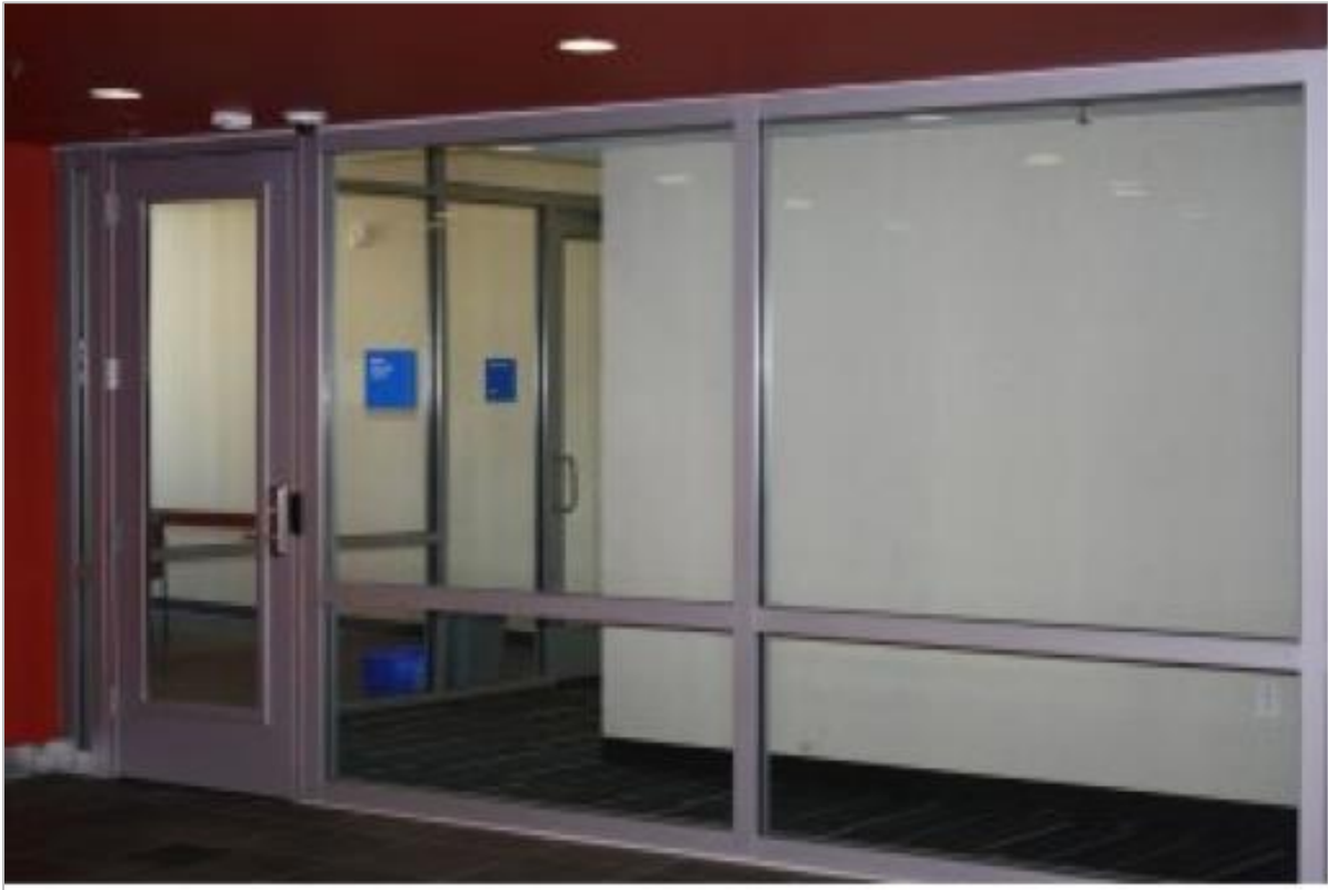
The glazing used in this 1-hour exit corridor exceeds 25% of the wall area. So, 60-minute fire resistive glazing and framing tested to ASTM E-119 was used in the assembly adjacent to the door.