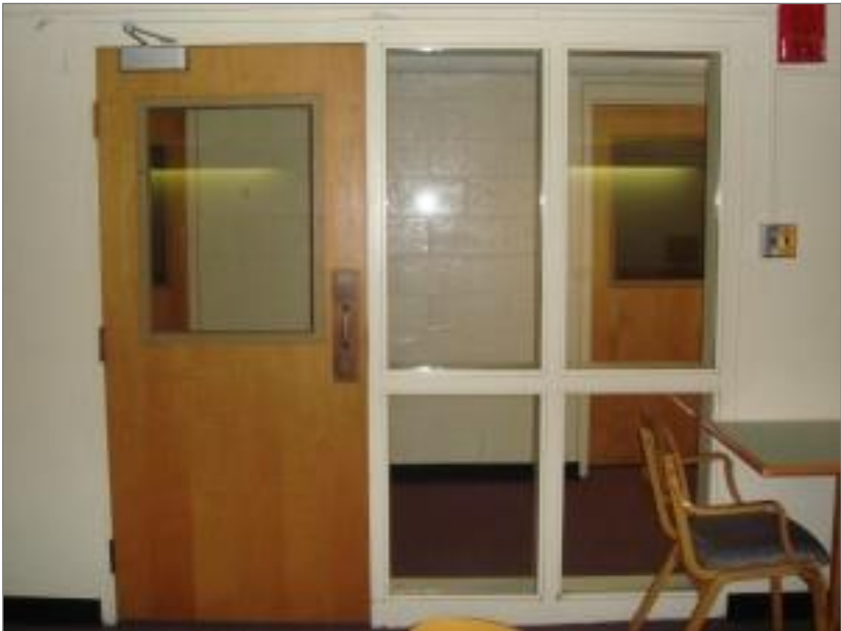
Middlebury College replaced unsafe wired glass in and around this dormitory door with SuperLite I (vision panel) and SuperLite II-XL (sidelites)