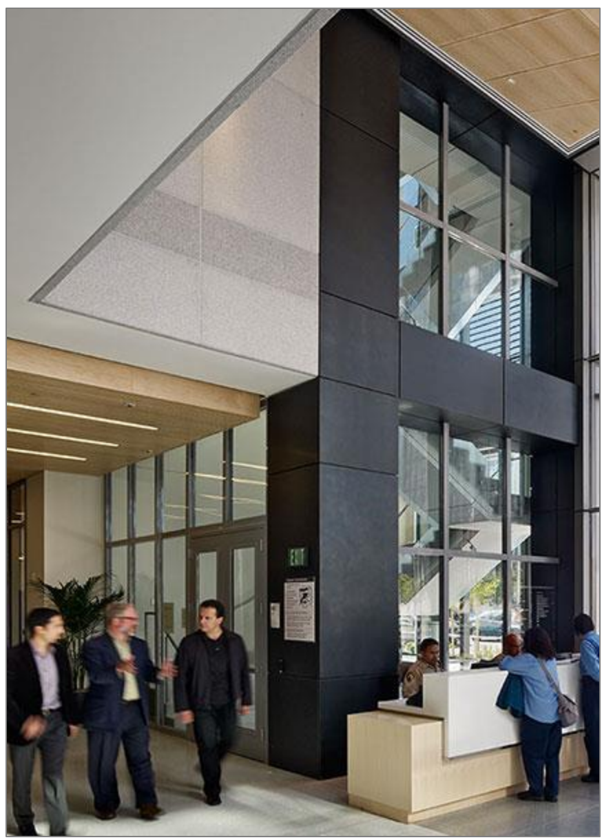
SuperLite II-XL 120 in GPX Framing is used on all 14-floors of the LEED Platinum-certified San Francisco Public Utilities Commission Building. This transparent 2-hour stairwell help bring daylight deeper into the building. Architect: KMD. Glazier: Progress Glass.

Health by Design. In 2013, New York City's Mayor Bloomberg issued an Executive Order to require all city agencies to use active design strategies in all new construction and renovation projects in order to get people moving. The Active Design Guidelines published in 2010 include a requirement to "focus on stairs rather than elevators as the principal means of vertical travel for those who are able to climb the stairs." In high-rise buildings, the Active Design checklist requires an integrated vertical circulation system that incorporates stair use between adjacent floors.