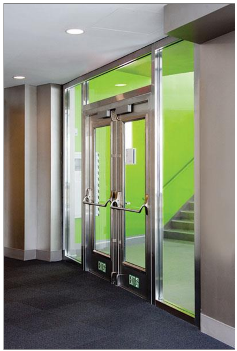
For this 2-hour stairwell, SuperLite II-XL 90 is used to exceed 100 sq. in. in the door vision panels while SuperLite II-XL 120 in Stainless Steel GPX Framing is used for the sidelites and transoms. Architect: KPF. Glazier: RG Creation. Project: CUNY School of Law in Long Island City, NY.

"The use of glass to pay design attention to fire stairwells and doors will add some cost to construction, but not nearly as much as slab-cut internal stairs. Fire stairs are not the only solution. In some older buildings, an existing light well or atrium could accommodate an internal stair without requiring slab cuts."