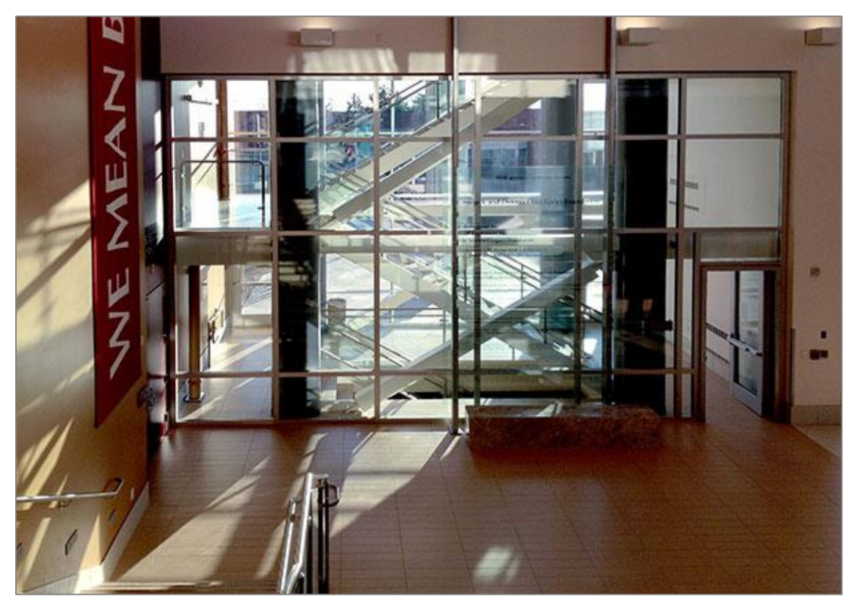
SuperLite II-XL 120 in GPX Framing add daylight and transparency to this 2-hour stairwell. Architect: MHTN Architects. Glazier: Mollerup Glass. Project: David Eccles School of Business at the University of UT in Salt Lake City, UT.

Occupant Safety. Better designed stairways with wider steps, natural light and openness to building interiors are safer. When the Architectural Team in Boston redeveloped the 1939 Homes at Old Colony, a public housing project, they removed dark isolated stairways and replaced them with stairways filled with natural daylight that opened to lobbies. The result is that residents are safer and more connected to the community. And, by adding additional, spacious, accessible stairways leading to exits and built to code using fire rated glass and framing, you improve emergency exit safety in the event of a fire.