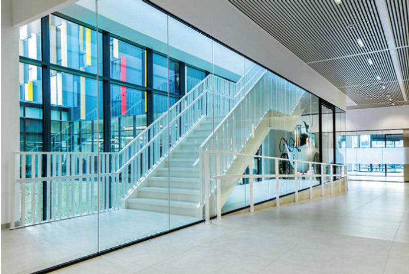
SuperLite® II-XLM 60 in a 1-hour butt-glazed wall application

60 Minute Fire Resistive Multilaminate Glazing