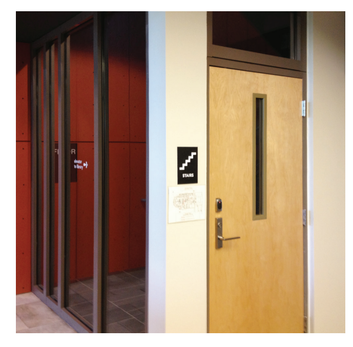
SuperLite X-90 vision kit in 90 minute temperature rise door

SuperLite X-90 is listed and labeled by Intertek/ Warnock-Hersey Inc., a nationally recognized testing laboratory approved by OSHA.