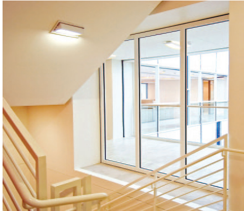
Project: CA Endowment Building in Los Angeles, CA Architect: House and Robertson Architects Glazier: Benson Industries, Inc.

Here are two examples of how GPX Framing with SuperLite II-XL glazing enhances interior spaces with elegant transparency during normal use, while protecting building occupants from the danger of radiant heat and providing safe egress during a fire.