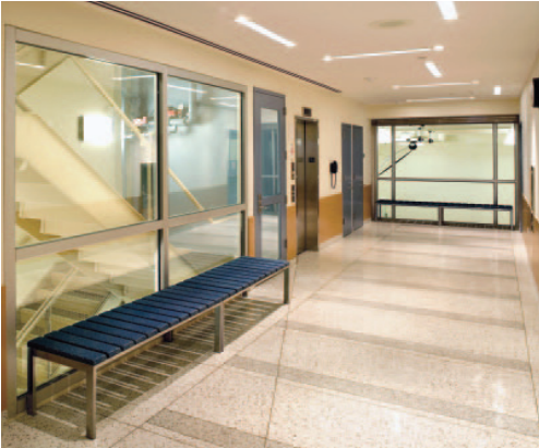
Project: Reece School in New York, NY Architect: Platt Byard Dovell White Architects LLP Glazier: Industrial Window Corporation