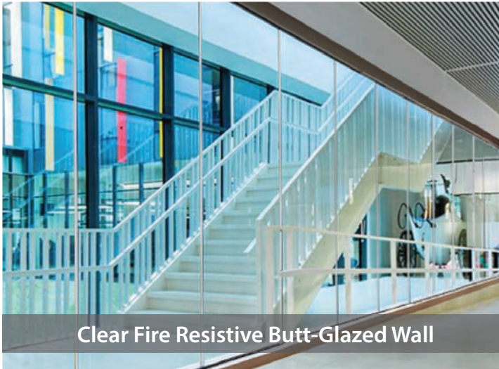
Clear Fire Resistive Butt-Glazed Wall