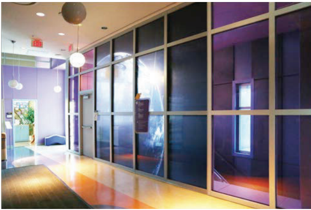
▲ 2-Hour Fire Resistive Stairwell Enclosure with Digitally Printed Glass by SAFTI FIRST

4 Fire Resistive Transparent Butt-Glazed Walls Designers can now achieve truly transparent fire resistive glass walls up to two hours without vertical mullions or spacers using fire resistive multilaminates like SuperLite II-XLM . This product meets ASTM E-119 up to two hours with a hose stream test, and is impact safety rated to the maximum safety standard CPSC Cat. II. SuperLite II-XLM is available in large sizes and can be used in all fire rated 20/45/60/90/120 minute applications, including clear butt-glazed walls for maximum vision and transparency.