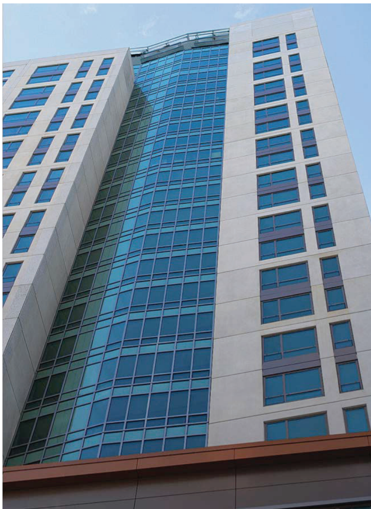
▲ The Kensington in Boston incorporates a 60-minute fire resistive curtain wall adjacent to the non-rated systems.

Whether it's New York City, Boston, Chicago, San Francisco, or any other densely populated city, an exterior wall may or may not be allowed to have openings depending on the fire separation distance. When allowed, the codes distinguish between openings that are "protected" (fire protective doors, windows, shutters) and "unprotected" (no fire rating).