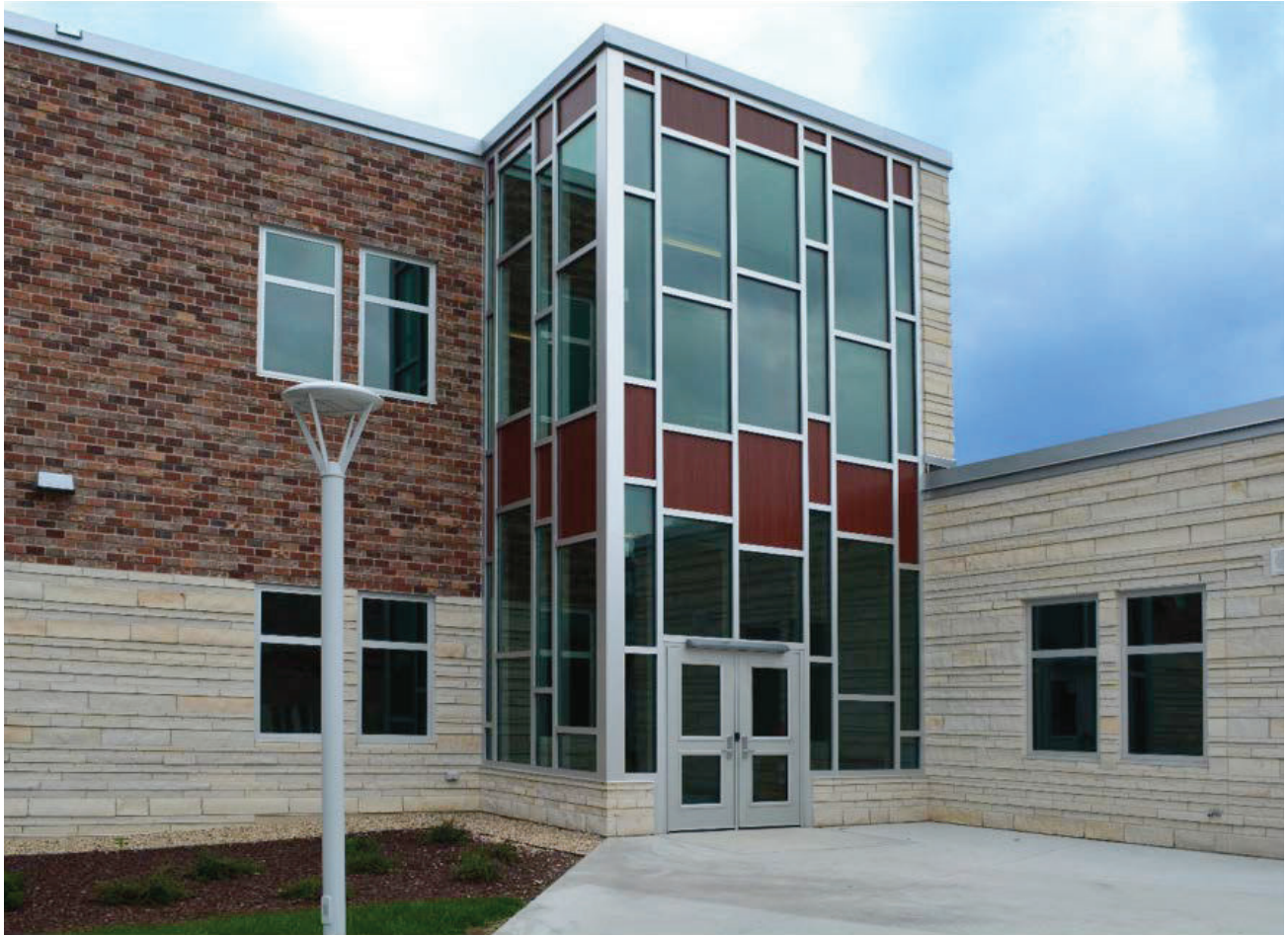
▲ Kromrey Middle School in Madison, Wis., has a 60-minute fire resistive curtain wall that can withstand dramatic weather conditions.

Table 705.8 in the 2012 and 2015 IBC lay out the percentage of protected and unprotected openings and size limits allowed in exterior walls. Fire protective glass tested to NFPA 252/257, such as ceramics and wired glass, is either limited in size or prohibited altogether, depending on the fire separation distance. Generally speaking, as the fire separation distance increases, the allowable opening area and the percentage of allowable fire protective openings increases.