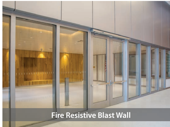
Fire Resistive Blast Wall