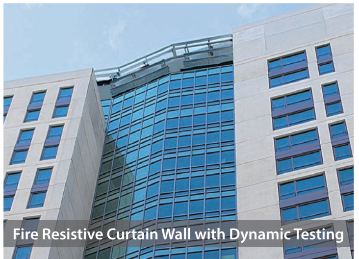
Fire Resistive Curtain Wall with Dynamic Testing