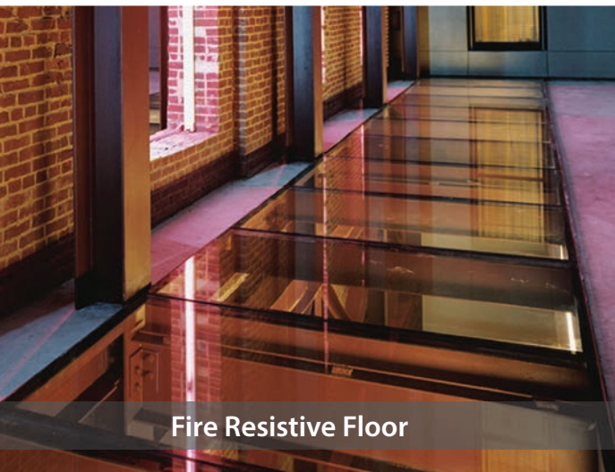
Fire Resistive Floor