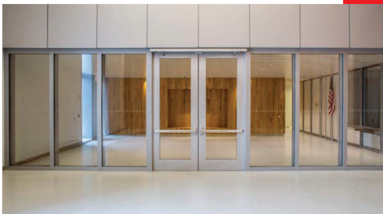
▲ 2-Hour Fire Resistive Blast Rated Wall by SAFTI FIRST

Decorative art glass has been used for many years to either tell a story or beautify any space, as seen in stained glass windows in churches and historical buildings, to name a few. Now, decorative glass can be combined with fire rated glass to bring a unique design element to any space where fire ratings are required. This can include stained glass, patterned glass, textured glass, colored glass, digitally printed glass, and even glass embedded with LEDs designed to display high-impact visuals.