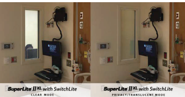
▲ SuperLite II-XL 45 with SwithLite by SAFTI FIRST

5 Fire Resistive Switchable Privacy Glass There are instances where the same spaces that use glass in windows, doors, or walls for vision and transparency also have a need or desire for privacy. Before, the only solution was to use curtains or external window blinds to block views when needed. This can be a problem in hospitals, laboratories, clean room, etc., because curtains and exterior blinds tend to accumulate and trap dust and other allergens. Introducing glass with integrated blinds solved this issue of accumulating dust and allergens, but it doesn't exactly have the high-tech look.